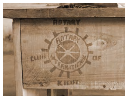
Desks Provided By Kilifi Rotary Club