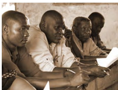
Current Leaders of Kilifi: Rotarians