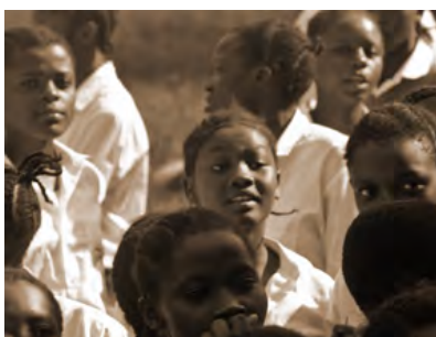
Future Leaders of Kilifi